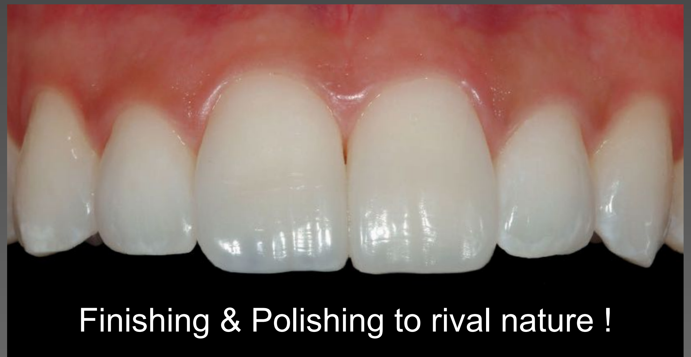
Finishing & Polishing to rival nature !

Diastema Closure and Conservative Form Corrections