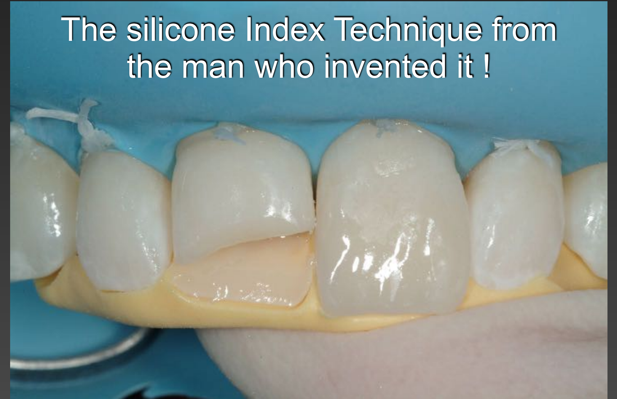
The silicone Index Technique from the man who invented it !