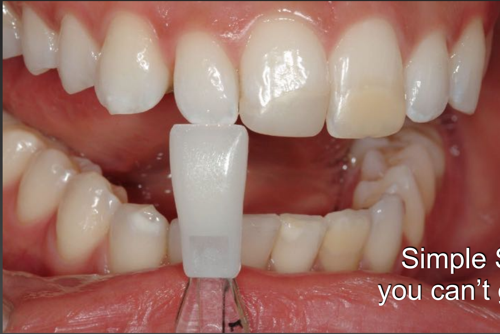
Simple Shading you can't get wrong

Learn the evidence based theory and the simplified and practical techniques to restore anterior teeth with Direct Composite - from the best in the business !