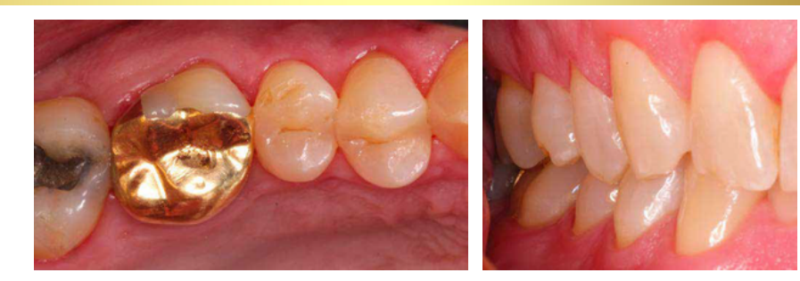
Upper 1st molar aesthetic 3/4 gold crown. Again, invisable in a normal smile

He is a passionate advocate for the correct use of gold restorations. We are very fortunate to have him visit Australia - Don't miss this opportunity to learn directly from one of the very finest Gold Clinicians !!